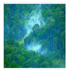
Kakamega Forest Heritage Foundation - Moma | En