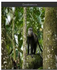
Kakamega Forest Animals - Wildlife in Kenya