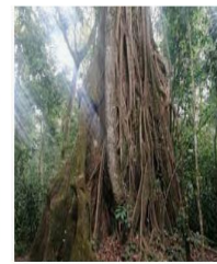
Kakamega forest, a natural gem under threat ... climatetracker.org