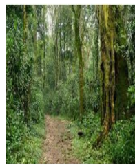
Kakamega Forest National Reserve | Sims Safari