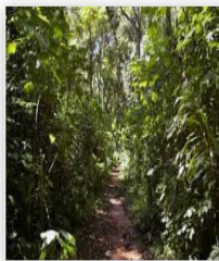
Kakamega Rainforest Reserve - Area Informatio