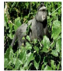
Kakamega Forest Reserve - Kenyan Safari Guide kenyasafari.com