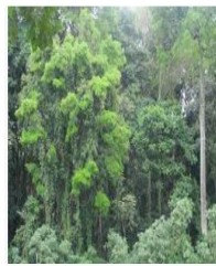
Kakamega Forest National Reserve - All You ... tripadvisor.com