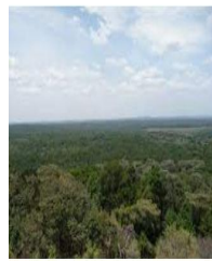
Kakamega Forest - Wikipedia wikipedia.org

ACTIVITIES: Bird watching, hiking and rock climbing can be enjoyed here in the serenity of the forest that time forgot!