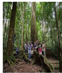
Kakamega Forest National Reserve - Ruindi En